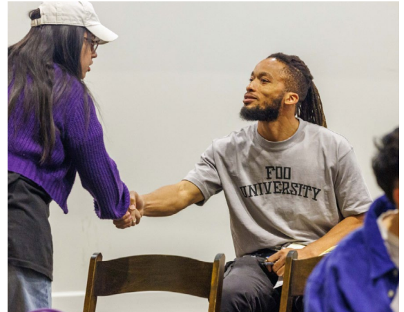
Artists collaborate at Art Access' event