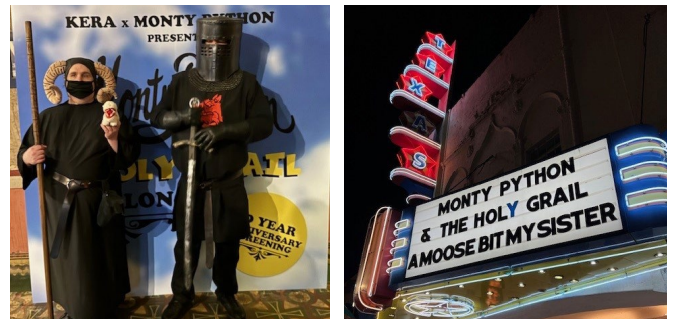
KERA celebrated 50 years since introducing America to Monty Python.

In a partnership with Dallas Truth, Racial Healing & Transformation, KERA's Video team spent months chronicling the history of different neighborhoods and communities in Dallas' racial history. The result was a new six-part series that premiered in early FY25 on KERA TV and streaming, exploring stories from neighborhoods like Fair Park, Little Mexico, Little Asia and more.