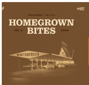
The cover of KXT's Homegrown Bites Vol 1