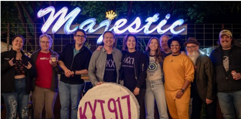
The KXT Team