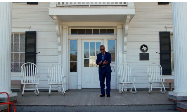
A still from KERA's "Recovering the Stories."

KERA's original film series marked its 32nd season in early FY25. The locally produced series highlights independent filmmaking from across Texas. Of note is the fact that the series is drawing a younger audience as compared to other PBS programming, with a significant portion of viewers in the 25-49 age group.