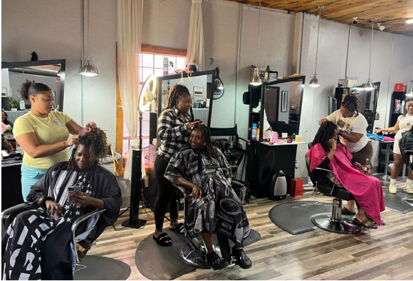
At Dreads by Dodie in South Dallas, a group of women discuss the issues that concern them the most in this year's election.