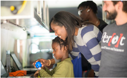
Families engage in S.T.E.A.M. activities at Kids Fest 2024.

"I really love all the education and tools [KERA] gives parents. I will definitely download the apps and allow my child to have access to media in a safer and educational way."